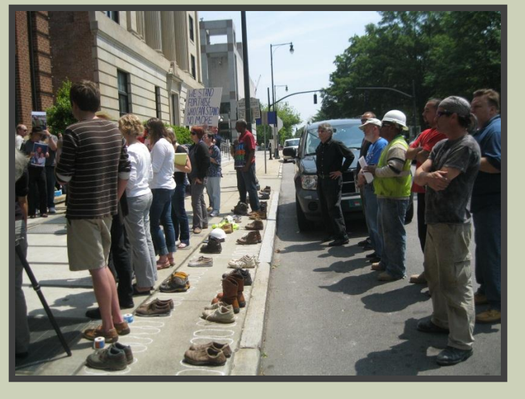
Workers Memorial Day