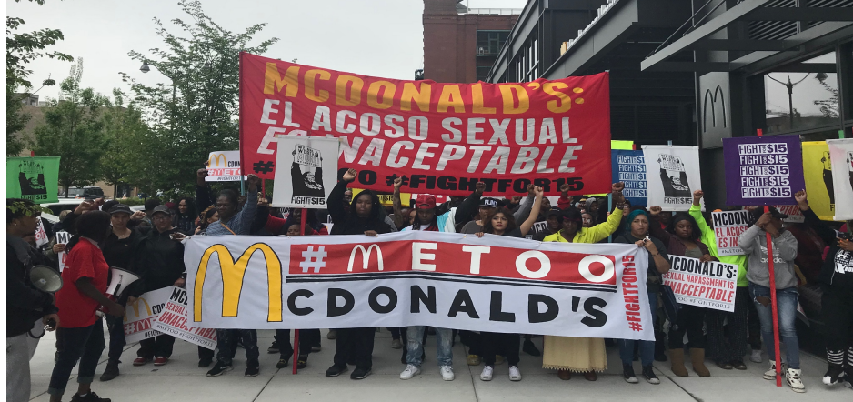
McDonald's workers are fighting back against sexual harassment on the job.

Headquarters in Chicago, Illinois Franchises and corporate-owned stores around the globe