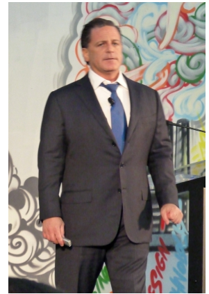
Billionaire Dan Gilbert. Executives at Bedrock Detroit, one of many firms he owns, reacted aggressively when the company was cited for safety violations.

In the two years leading up to and including that inspection, MIOSHA opened six inspections of 14 employers working at Bedrock properties, found 31 violations and collected $21,000 in penalties. In the two years after