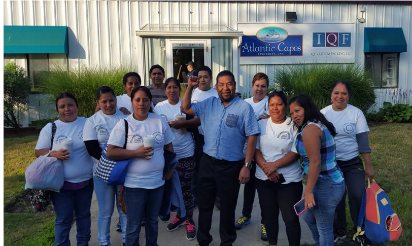
Workers at Atlantic Capes Fisheries want clear language and appropriate sexual harassment training.

Strong measures are needed to ensure that other companies like Atlantic Capes engage in proactive measures to avert sexual harassment, and to penalize those that fail to act. The proposed Bringing an End to Harassment by Enhancing Accountability and Rejecting Discrimination in the Workplace Act (BE HEARD), introduced by Senator Patty Murray (D-WA) and Rep. Katherine Clark (D-MA) in April 2019, is intended to protect workers and hold employers accountable.