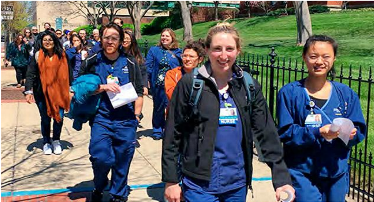
Nurses at Johns Hopkins Hospital in Baltimore rally for job safety and workplace rights