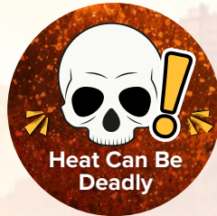
Heat Can Be Deadly

Employers are responsible for keeping workers safe