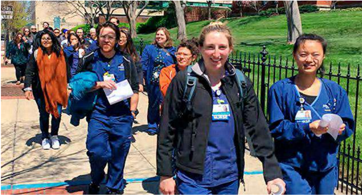
Nurses at Johns Hopkins Hospital in Baltimore rally for job safety and workplace rights