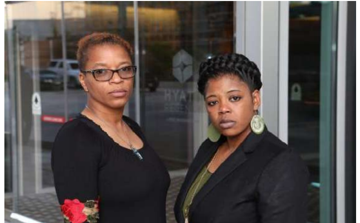
XPO warehouse closure “reeks of retaliation” against workers seeking answers about death and miscarriages on the job.

On February 25, the company announced that jobs would be available for workers at the closed facility at other XPO warehouses. As of mid-April, however, many workers at the closed warehouse still do not have information about possible new assignments.