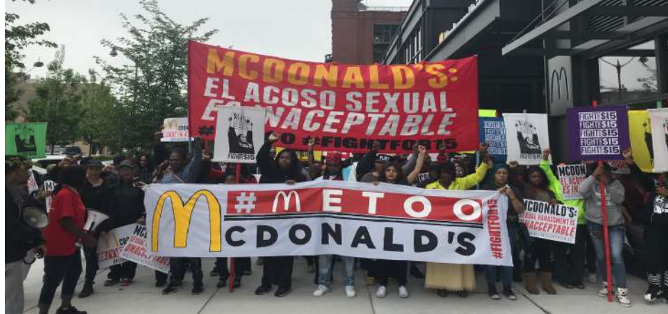
McDonald's workers are fighting back against sexual harassment on the job.

Headquarters in Chicago, Illinois Franchises and corporate-owned stores around the globe