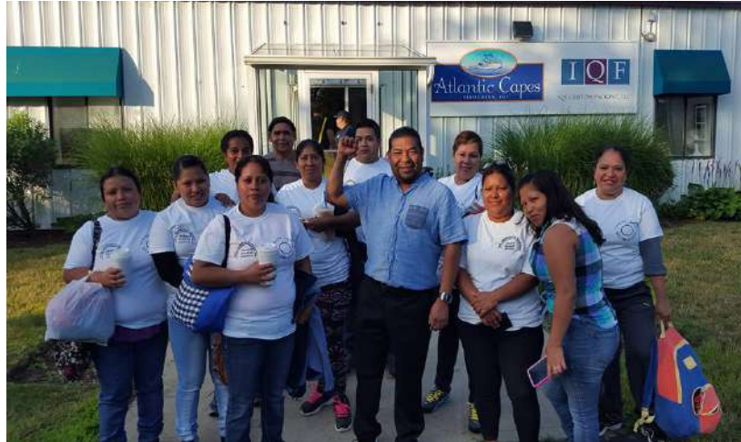
Workers at Atlantic Capes Fisheries want clear language and appropriate sexual harassment training.

Strong measures are needed to ensure that other companies like Atlantic Capes engage in proactive measures to avert sexual harassment, and to penalize those that fail to act. The proposed Bringing an End to Harassment by Enhancing Accountability and Rejecting Discrimination in the Workplace Act (BE HEARD), introduced by Senator Patty Murray (D-WA) and Rep. Katherine Clark (D-MA) in April 2019, is intended to protect workers and hold employers accountable.