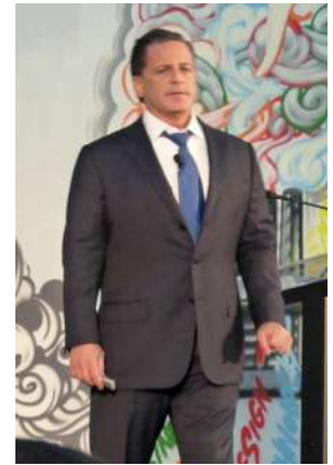
Billionaire Dan Gilbert. Executives at Bedrock Detroit, one of many firms he owns, reacted aggressively when the company was cited for safety violations.

In the two years leading up to and including that inspection, MIOSHA opened six inspections of 14 employers working at Bedrock properties, found 31 violations and collected $21,000 in penalties. In the two years after