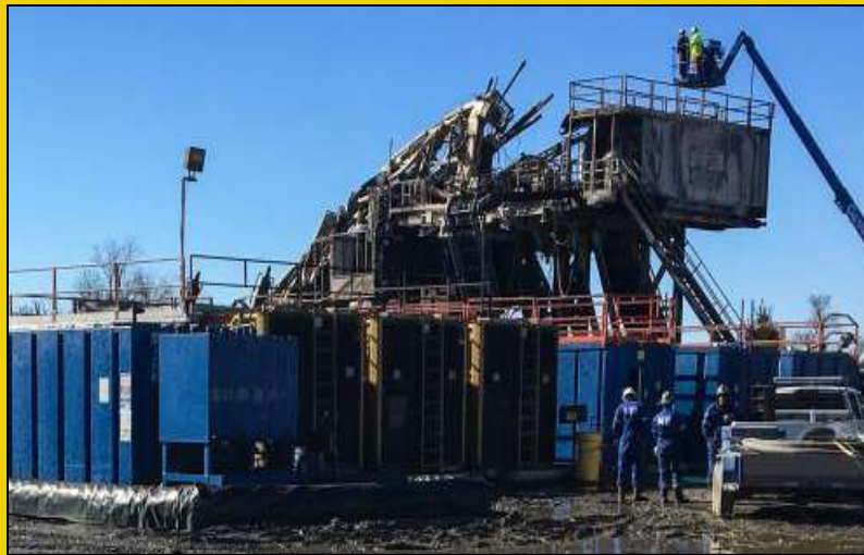
Inspections underway at site of gas well explosion in Quinton, Oklahoma, one of the worst onshore drilling disasters in U.S. history.

On January 21 of this year, five workers in Quinton, Oklahoma lost their lives after an explosion on a natural gas drilling platform operated by Patterson UTI. The Texas-based company has a long history of safety violations, including a death toll that now adds up to 13 workers in the last decade.