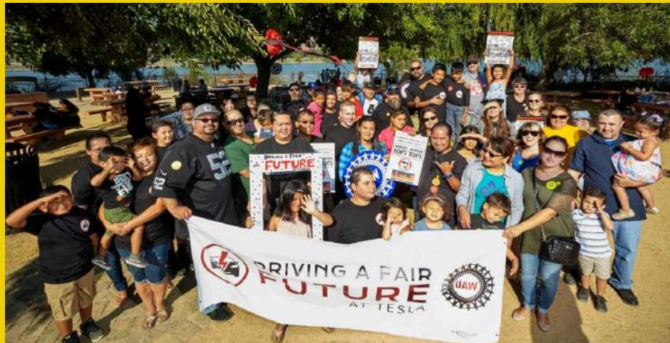
Tesla workers in Fremont, CA rally for safe working conditions and workplace rights

Tesla Motors, led by high-profile CEO Elon Musk, is a leading U.S. manufacturer of electric vehicles, with an auto assembly plant at an auto assembly plant in Fremont, California. According to testimony from workers, research by National COSH affiliate Worksafe, and recent citations by Cal/OSHA, Tesla’s clean cars are produced by workers who must endure dirty, unsafe working conditions.